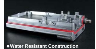
• Water Resistant Construction

Ideal for reception in noisy environments, the VX-160E's high-powered audio is coupled to a large internal speaker, assuring solid copy throughout difficult construction site or field operations.